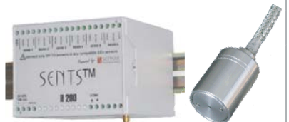
H200 telemetry unit